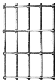
16 ga. 1/2"x1"