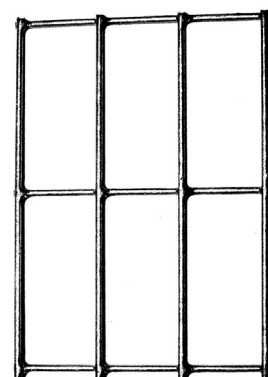
14 ga. 1"x2"